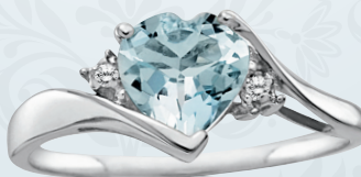
Aquamarine & Diamond 10K White Gold $169 Reg. $345 Web ID 842773A

Regular prices may not have resulted in sales. Intermediate markdowns may have been taken. Advertised items may be offered in future sale events. Gemstones may have been treated or enhanced. Prices effective through March 31, 2012.