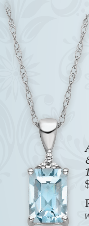
Aquamarine & Diamond 10K White Gold $149 Reg. $225 Web ID 1077650A