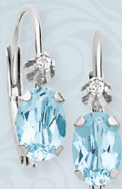
Aquamarine & Diamond 10K White Gold $9999 Reg. $165 Web ID 1242668A