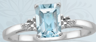
Aquamarine & Diamond 10K White Gold $159 Reg. $265 Web ID 1077890A