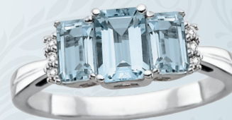
Aquamarine & Diamond 10K White Gold $169 Reg. $285 Web ID 1231042A