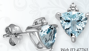
Web ID 47761A