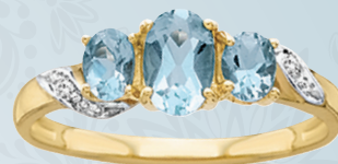
Aquamarine & Diamond 10K Yellow Gold $149 Reg. $325 Web ID 714543A