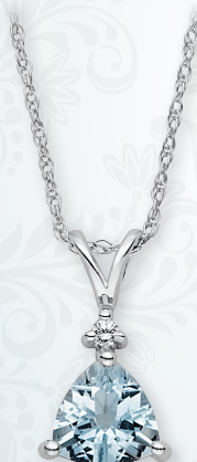
Web ID 47753A