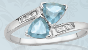
Aquamarine & Diamond 10K White Gold $199 Reg. $345 Web ID 1243526A