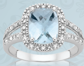
Aquamarine & Diamond 10K White Gold $449 Reg. $645 Web ID 1355866A